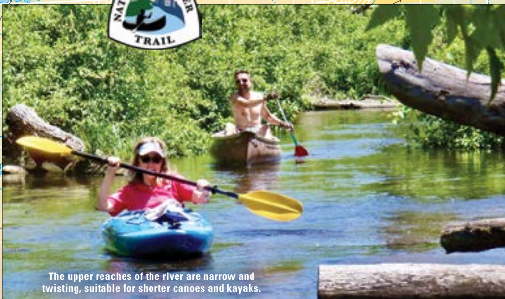
The upper reaches of the river are narrow and twisting, suitable for shorter canoes and kayaks.